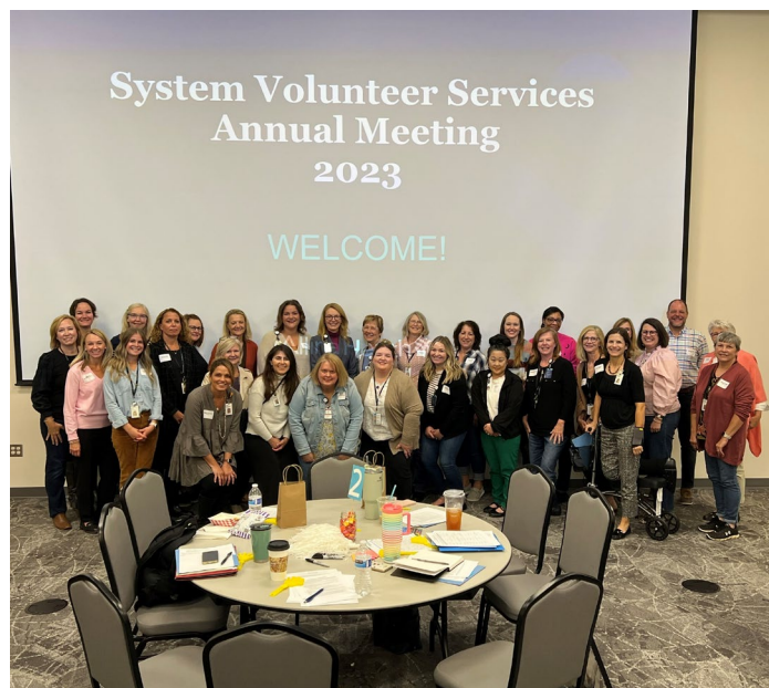
Allina Health volunteer coordinators gather for their first Annual Meeting