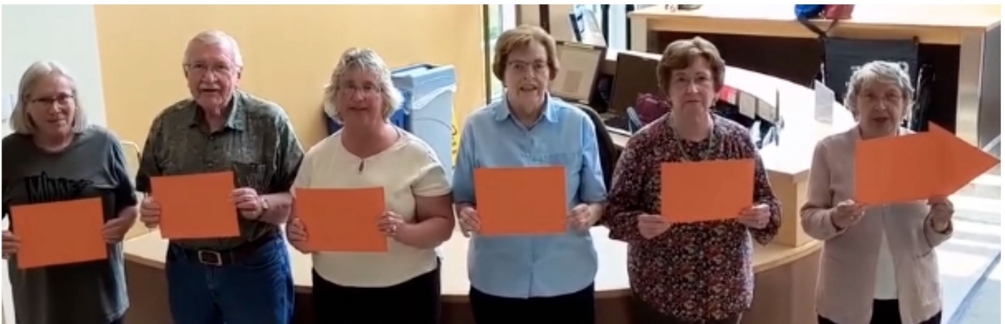
Volunteers from across all of Allina Health – human and canine!