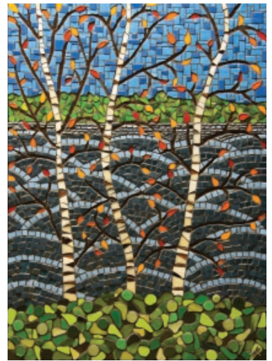
Dancing Birch Suzanne Demeules, Buffalo, MN