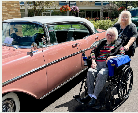
Senior living car show